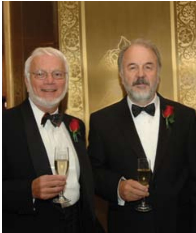
(From left) Thomas Steitz and Harry Noller, both experts on the structure of the ribosome, celebrate their achievements at the Gairdner International Awards ceremony in Toronto, Canada.

The Gairdner Foundation was founded in 1957 by Toronto financier