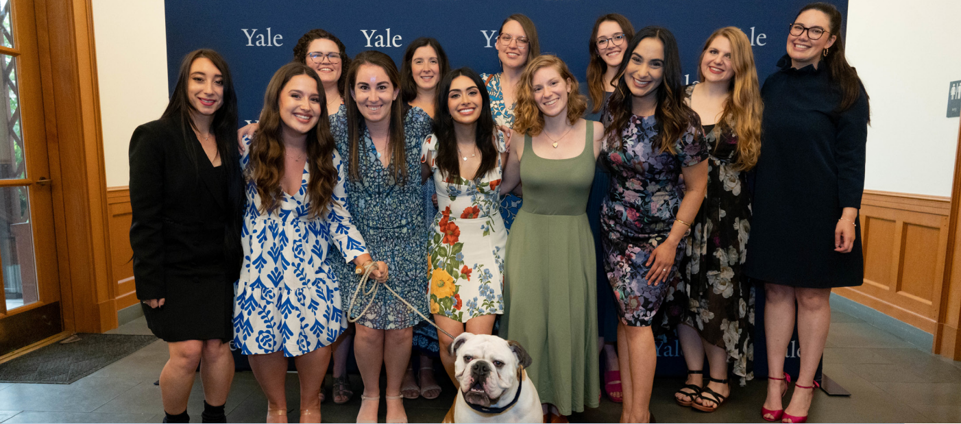
2022-23 Fellows celebrating a successful year at their June graduation.