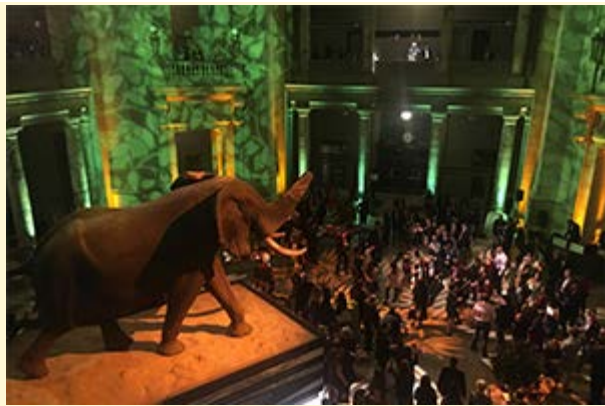
"A night at the museum" at AASLD 2017