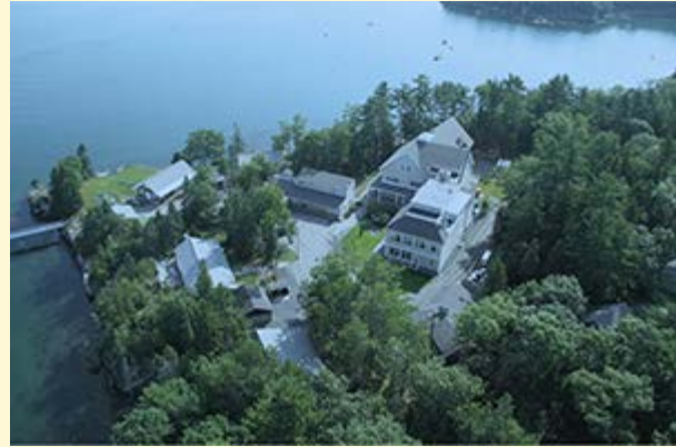
Aerial photo of Mount Desert Island facility in Maine