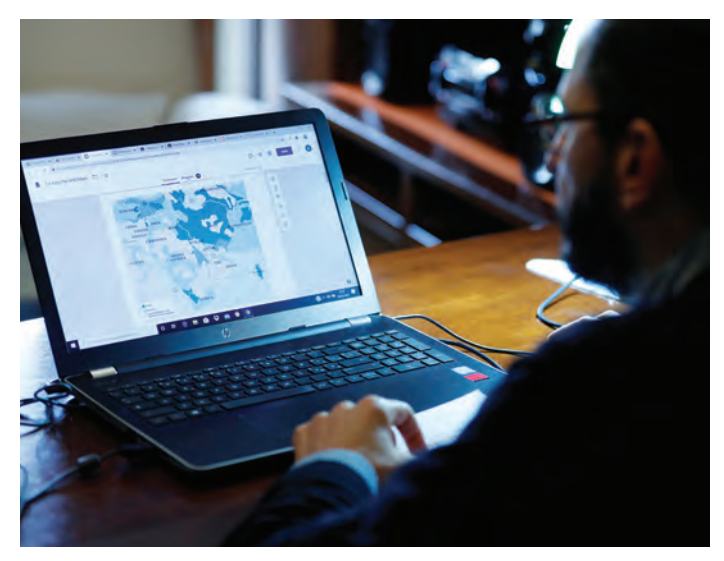
Children in Italy attend school 200 days a year. Here, a teacher near Milan prepares a lesson for his students.

outcomes, particularly in systems that are moving from "poor" to "fair."