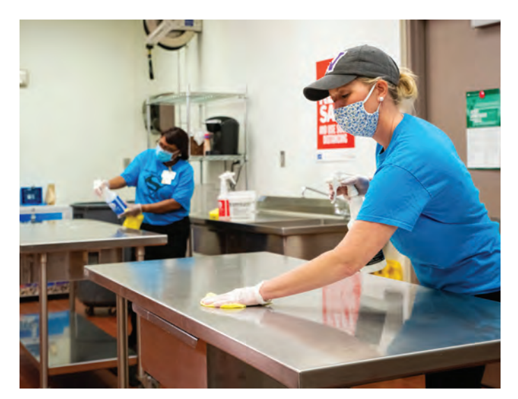
Districts are working with public health officials to determine when to reopen schools and are cleaning, sanitizing, and disinfecting their buildings.

Middle and high school students also need the academic, social, and emotional benefits of physical proximity to their peers and teachers. We recommend reorganizing students into small mentor groups of fewer than a dozen of their peers and a mentor teacher, with whom they can learn throughout the year—whether in a physical school building or not. This mentor teacher may not, in fact, be in charge of their instruction, which could be delivered online by another teacher with subject matter expertisemeaning that students need not be assigned to groups by academic aptitude. However, for reasons articulated below, it makes sense for trusted adults to serve as group mentors, with the support of other staff as needed. Reorganizing in this manner would accommodate social distancing, honor the need for ongoing social interactions, and account for health and safety precautions within the limitations of school facilities.