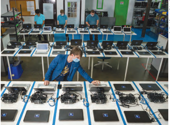
Workers prepare laptops for distribution.

The National Center on Time and Learning (NCTL) and the Education Commission of the States (ECS) have led the movement to extend both the school day and the school year, having issued their first call to radically alter the school calendar in 1994 ( Prisoners of Time ). Many systems have done so, such that <u>1,200 district and</u>