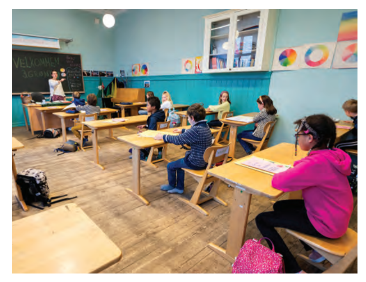
Children in Norway attend school for 190 days or more. Here, children listen to their teacher during a class in Oslo.

Does it work? A <u>meta-analysis</u> of international studies does show that increased instructional time benefits student achievement (although there may be a "ceiling effect"), and some studies of individual countries find the same ( e.g. , <u>Switzerland</u> and <u>Germany</u>). And a <u>McKinsey study</u> of international school improvement models noted that adding hours of instruction to the day was a hallmark feature that worked to boost student