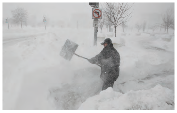
The National School Safety Center has said online learning could be integral to districts' emergency plans for not just medical crises but also severe weather events such as snowstorms. ( Reuters )

Policymakers in the United States have long urged schools to be prepared for exogenous crises, including pandemics; see the <u>National Association of School</u> <u>Psychologists</u> and the US Department of Education's guidance on continuity of learning during epidemics (2009), <u>here</u>. As the director of the National School Safety Center, Ronald D. Stephens, noted back in 2003, online learning "could be integral to a school district's emergency plan, not just for drawn-out medical crises like SARS, but also for situations like [2002] sniper shootings in the Washington area; a biological-weapons attack; and even more familiar crises such as snowstorms and tornadoes." Routine preparation for a panoply of events that could cause disruptions makes sense.