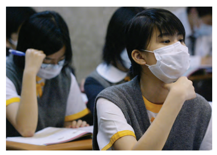
Students wearing masks to protect themselves from contracting SARS attend class in Hong Kong in 2003.

Another way to norm schools for success is to build practice with online learning into school calendars. The severe acute respiratory syndrome (SARS) epidemic in 2003 and natural disasters prompted Asian nations to do so; see <u>here</u>. A 2003 <u>essay</u> noted, for instance, that when students in Beijing, Hong Kong, and Singapore returned to school after SARS took them online, few of them were behind academically because they knew how to selfmanage in online learning environments.