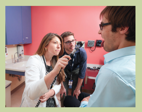
Yale Refugee Clinics provide the first domestic screening examination for all legally resettled refugees coming to the New Haven area.

Established in 1638, New Haven was the first planned municipality in America, organized geographically in nine squares, including a picturesque Green. Today, New Haven is a vibrant coastal city located on Long Island Sound between New York and Boston. Cultural opportunities abound, from dance, theater, and music to the treasures of Yale's art and natural history museums.