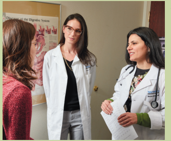
Patients from across the region seek out innovative treatments that are available through clinical trials.

The Yale Center for Clinical Investigation facilitates the training of clinical and translational scientists and provides infrastructure for innovative and collaborative research directed at improving patient care. It funds up to 22 YCCI Scholars yearly and supports investigators in the areas of biostatistics, bioinformatics, study design, core technologies, regulatory review, patient recruitment, and community-based research.