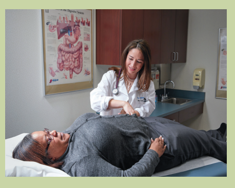
Yale Medicine, the School of Medicine's clinical practice, provides clinical care in more than 100 specialties and subspecialties.

More than 1,500 Yale physicians provide primary and specialty care for patients through Yale Medicine. The practice delivers advanced care in more than 100 specialties and subspecialties, and has centers of excellence in such fields as cancer, cardiac care, minimally invasive surgery, and organ transplantation. Yale physicians have made many historical contributions, including the first use of cancer chemotherapy, the first artificial heart pump, and the first insulin infusion pump for diabetes. Today they use such groundbreaking advances as DNA sequencing technology to diagnose suspected genetic diseases. Yale Medicine is a major referral center for Connecticut and New England, and treats patients from throughout the world.