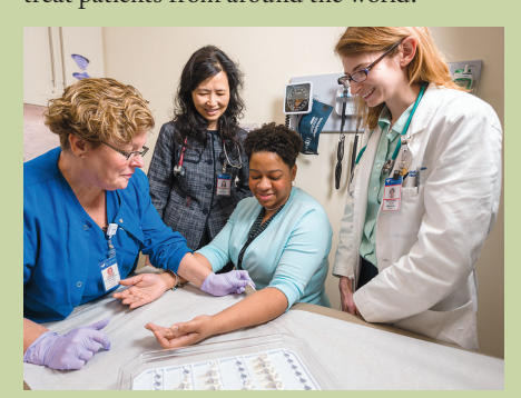
Yale Medicine, the School of Medicine's clinical practice, has more than 1,400 physicians who deliver advanced care in more than 100 specialties and subspecialties.

More than 1,400 Yale physicians provide primary and specialty care for patients through Yale Medicine. The practice delivers advanced care in more than 100 specialties and subspecialties, and has centers of excellence in such fields as cancer, cardiac care, minimally invasive surgery, and organ transplantation. Yale physicians have made many historical contributions, including the first use of cancer chemotherapy, the first artificial heart pump, and the first insulin infusion pump for diabetes. Today they provide such groundbreaking procedures as an "invisible incision" surgery to remove a woman's appendix, and the use of genome-scale DNA sequencing technology to diagnose suspected genetic diseases and birth defects. Yale Medicine is a major referral center for Connecticut and New England, and a national referral site for inherited liver diseases such as Gaucher's disease and Wilson's disease. Our physicians treat patients from around the world.