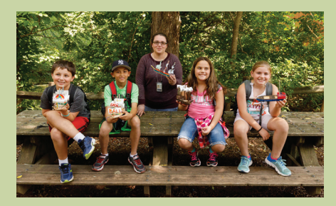
Children participated in a clinical trial to test an "artificial pancreas"—a closed-loop system that combines blood sugar monitoring and insulin delivery—in real-world settings.

The Yale Center for Clinical Investigation facilitates the training of clinical and translational scientists and provides infrastructure for innovative and collaborative research directed at improving patient care. It funds up to 22 YCCI Scholars yearly and supports investigators in the areas of biostatistics, bioinformatics, study design, core technologies, regulatory review, patient recruitment, and community-based research.