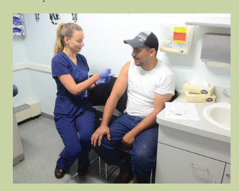
HAVEN, the student-run clinic that provides free medical care to uninsured patients in New Haven, relocated to renovated space in the Yale Physicians Building.

Established in 1638, New Haven was the first planned municipality in America, organized geographically in nine squares, including a picturesque Green. Today, New Haven is a vibrant coastal city located on Long Island Sound between New York and Boston. Cultural opportunities abound, from dance, theater, and music to the treasures of Yale's art and natural history museums.