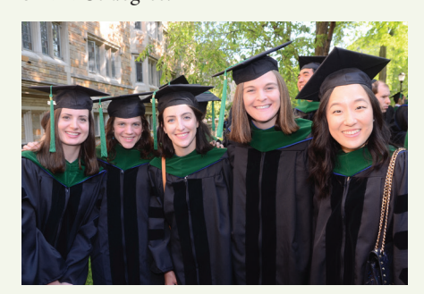
ABOVE: Students celebrated their graduation in May 2016, and advanced to top residency programs around the country. COVER: Sterling Hall of Medicine.

The sixth-oldest medical school in the United States, it was chartered by the Connecticut General Assembly in 1810 as the Medical Institution of Yale College, located first on Grove Street, then at 150 York Street. Since 1924, it has occupied Sterling Hall of Medicine at 333 Cedar Street and surrounding buildings. It has awarded 8,806 medical degrees since 1814. There are 5,607 living alumni with MD degrees, 4,506 with MPH degrees, and 1,113 alumni of the Physician Associate Program with the PA-C certificate or MMSc degree.