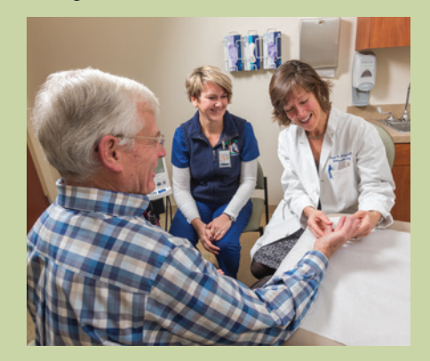
Yale Medical Group's new orthopaedics and rehabilitation office in Milford is one of more than 50 YMG locations in 27 towns and cities throughout Connecticut.

More than 1,000 Yale physicians provide primary and specialty care for patients through Yale Medical Group. Yale Medical Group delivers advanced care in more than 100 specialties and subspecialties, and has centers of excellence in such fields as cancer, cardiac care, minimally invasive surgery, and organ transplantation. Yale physicians have made many historical contributions, including the first use of cancer chemotherapy, the first artificial heart pump, and the first insulin infusion pump for diabetes. Today they perform such groundbreaking procedures as NOTES, a surgery without incisions, and recently became the first in the country to treat a patient with a life-threatening heart defect using an engineered blood vessel made from the patient's own cells. Yale Medical Group is a major referral center for Connecticut and New England, and treats patients from throughout the world.