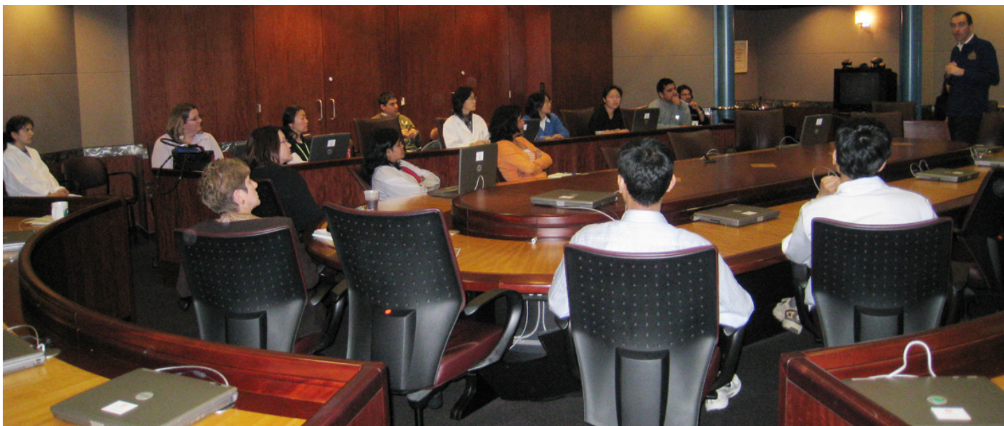
Postdoc Discussion Session during the NPA Team Visit to UTHSC-H