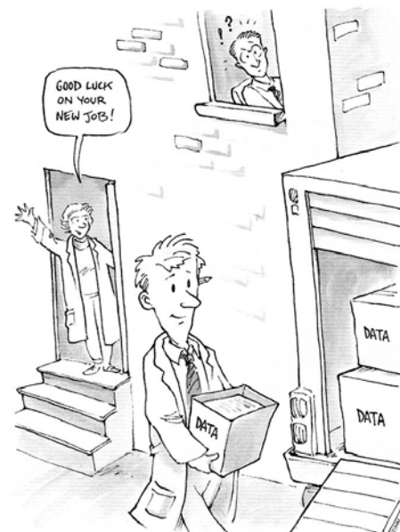
Illustration by David Zann

The goal of the NPA's Bring RCR Home project is to foster the creation of these types of programs through a combination of seed grants, 'train-the-trainers' workshops, technical assistance and an online toolkit for creating RCR programs. Most postdocs do not receive formal training in research ethics despite the unique needs of this population. Postdocs face a number of distinct challenges due to the nature of their position, such as the implications of a short-term appointment on data and project ownership or the potential complications for postdocs in collaborating outside their supervisor's lab. RCR programs that address these challenges could significantly benefit postdocs.