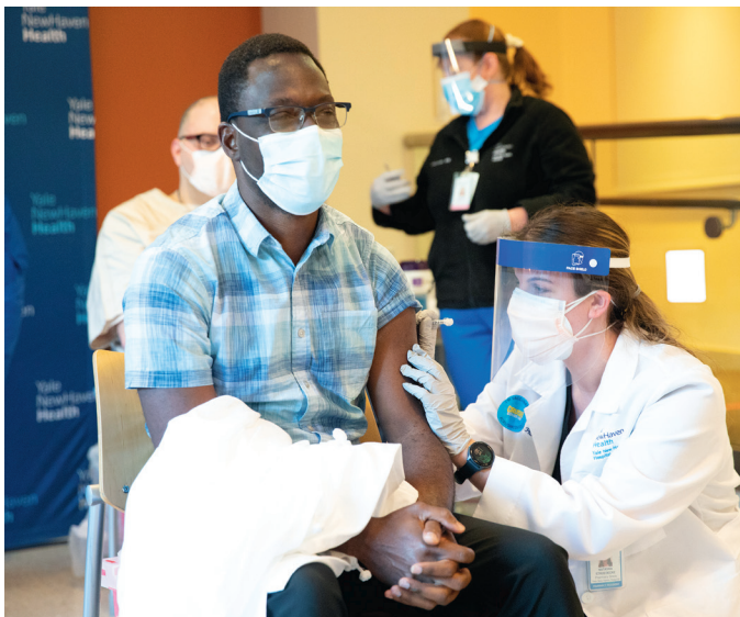
Yale School of Medicine investigators led trials of the COVID-19 Pfizer-BioNTech vaccine in adults and children, and Remdesivir, a therapeutic drug used to treat the disease.

The Yale Center for Clinical Investigation facilitates the training of clinical and translational scientists and provides infrastructure for innovative and collaborative research directed at improving patient care. It funds up to 20 YCCI Scholars yearly and supports investigators in the areas of biostatistics, bioinformatics, study design, core technologies, regulatory review, patient recruitment, and community-based research.