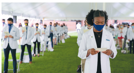
Medical students wore masks and socially distanced during the 2020 White Coat Ceremony, which was live-streamed for guests who were unable to attend due to the pandemic.

YSM's Physician Associate (PA) Program, one of the oldest PA programs in the country, and its Physician Assistant Online Program train students to become compassionate, high-quality, patient-centered PAs. The online program enables students to become PAs without relocating from their home communities.